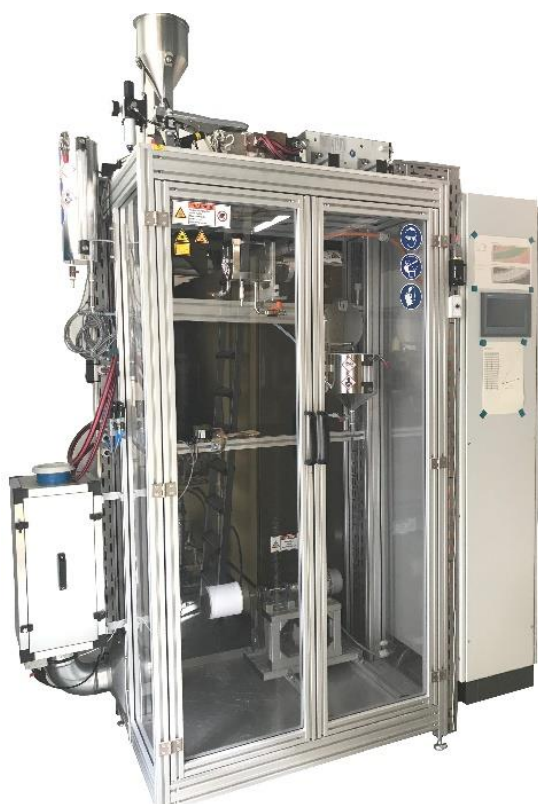
Fig. 1: Glass monofilament spinning machine by Woltz Glasfasertechnologie GmbH including the coating stage and fume extraction unit specific to CMASLab's bicomponent fiber production method.

CMAS Lab has acquired a customized glass monofilament spinning machine (Fig. 1) from Woltz Glasfasertechnologie GmbH, which was commissioned in Zurich during March 2018. It was financed in part by an equipment grant from ETH Zurich and by the chair's own resources. Since the commissioning, the spinning of e-glass monofilaments has been fully characterized. The setup also includes a coating unit with which hybrid bicomponent fibers can be manufactured. This process is currently under investigation and it is expected that a set of process parameters resulting in a robust manufacturing of such hybrid monofilaments will be identified at the end of 2018.