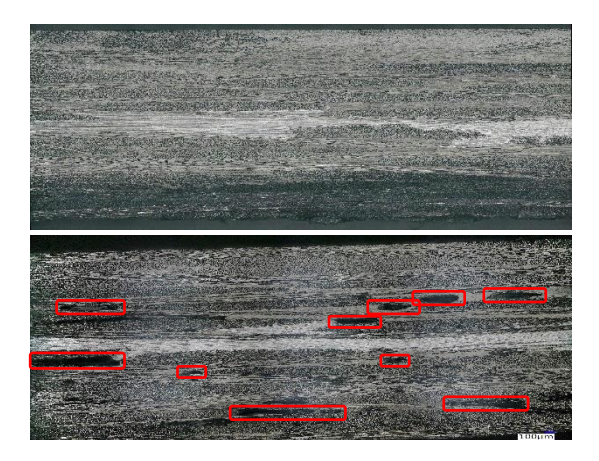
Figure 1. Micrographs of two plates after impregnation with different process parameters (porosities are circled in red).